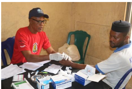
A male beneficiary receiving free lab test