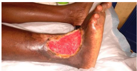
A community member of Udung Uwe with leg ulcer before treatment