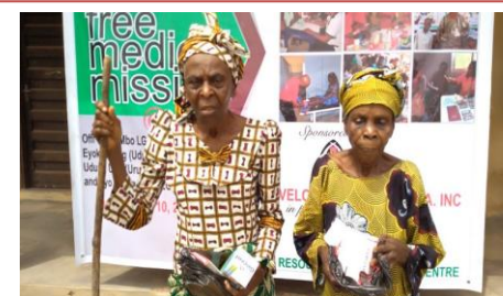
Two elderly women displaying the free medications they received at the pharmacy during the outreach