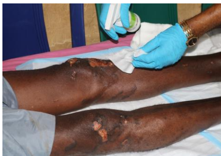
An elderly man with leg injuries