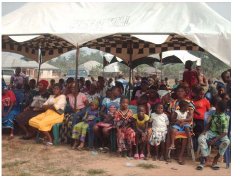
Community members of Udung Uwe already seated in great numbers early in the morning before outreach started