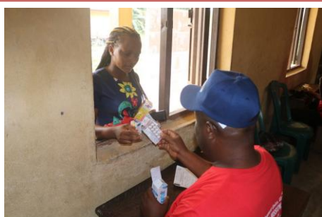
A young nursing mother receiving free medication at the pharmacy unit during the outreach