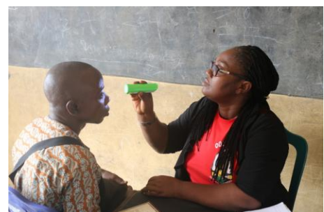
A male beneficiary receiving free eye screening