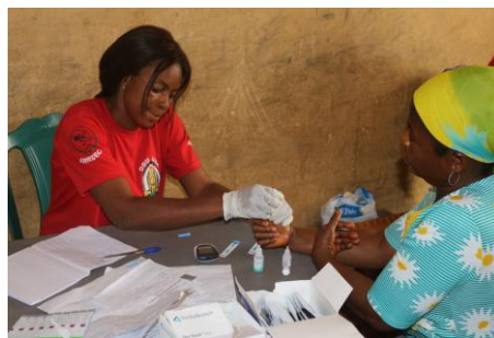
A female beneficiary receiving free lab test