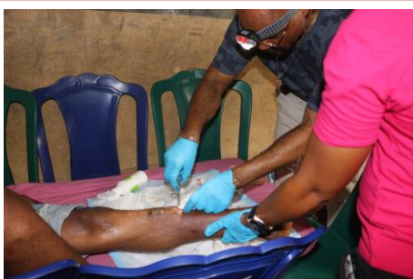
Wound before treatment