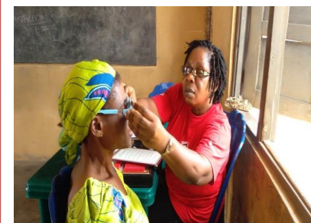
A female beneficiary receiving free eye screening