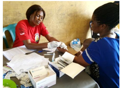
A female beneficiary receiving free lab test