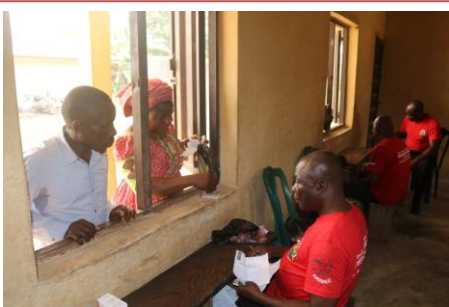
Beneficiaries receiving free medication at the pharmacy unit during the outreach