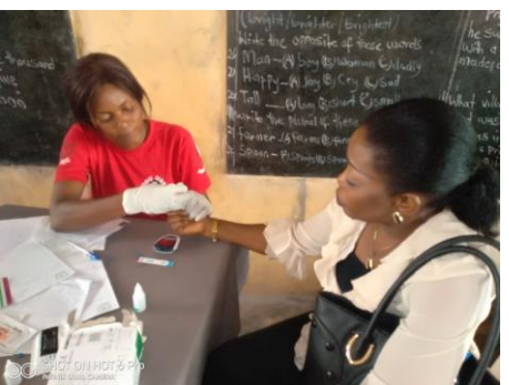
A female beneficiary receiving free lab test