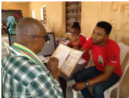
A male beneficiary receiving free eye screening