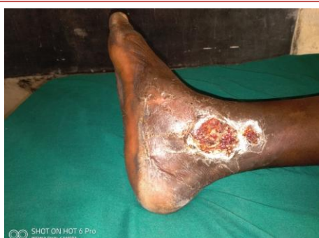
A male beneficiary with leg ulcer