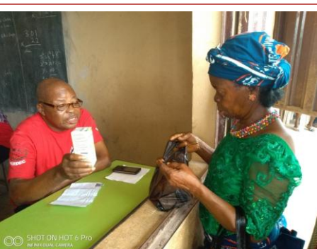
An elderly woman receiving free medication at the pharmacy unit