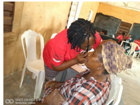
A female beneficiary receiving free eye screening