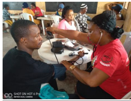
Nurse taking vital signs of a of a male beneficiary