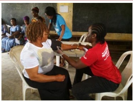
A Nurse taking vital signs of a of a female beneficiary