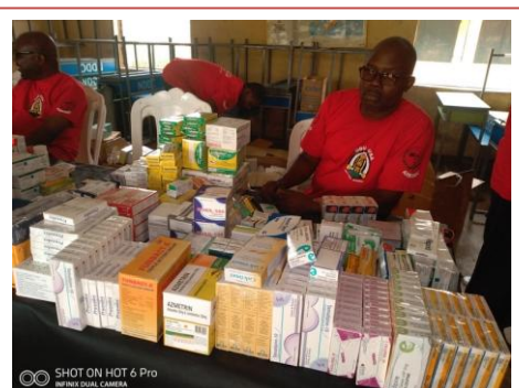
Pharmacists dispensing medication at the pharmacy Unit