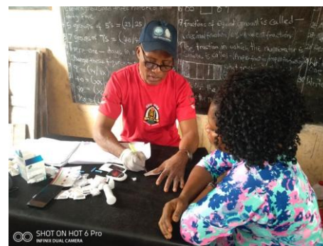
A female beneficiary receiving free lab test