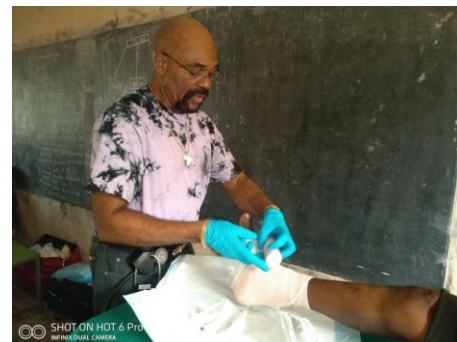
The male beneficiary's leg after the treatment