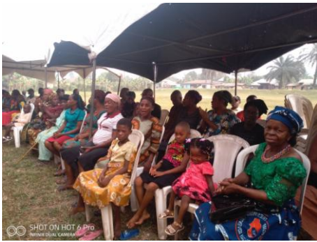
Community members of Eyokponung already seated in great numbers early in the morning before start of the outreach