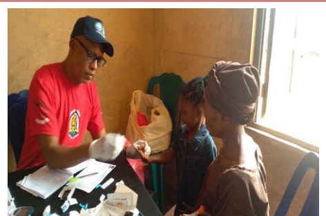
A female minor receiving free lab test while the mother watched