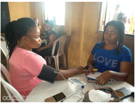
Nurse taking vital signs of a of a female beneficiary