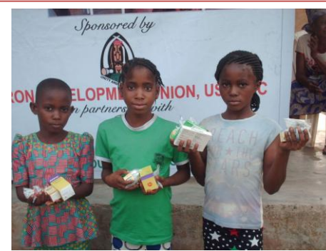
Children displaying free medication they received at the outreach