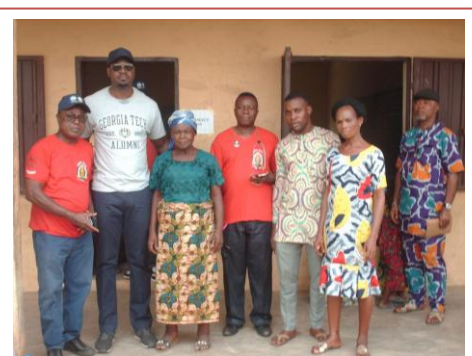
The woman (3 rd left) after she was revived.