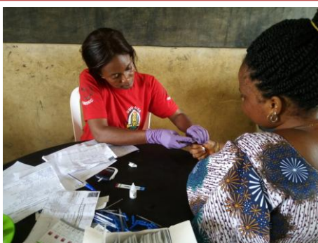
A female beneficiary receiving free lab test