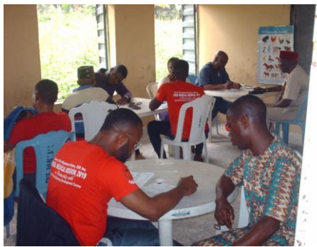
Doctors conducting health assessment and illness diagnosis on beneficiaries