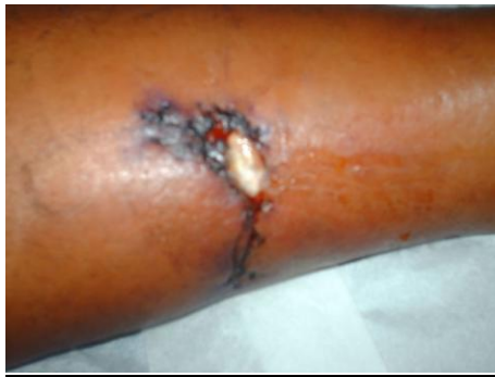
Wound before treatment