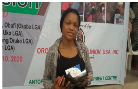
A young female beneficiary displaying free medication she received at the pharmacy unit during the outreach