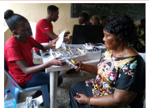
A female beneficiary receiving free eye glasses