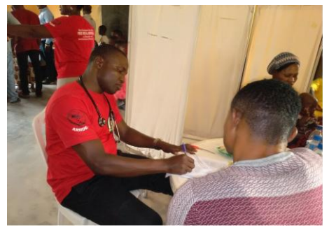
Dr. Ifiok Bassey conducting health assessment and illness diagnosis on a male beneficiary