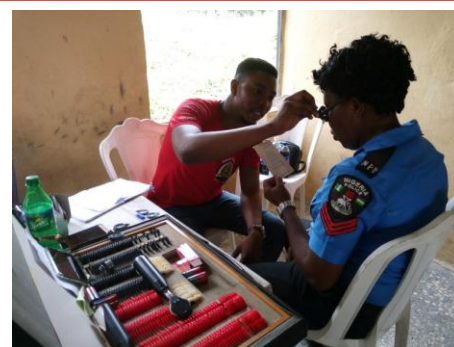
A female police officer receiving free eye screening