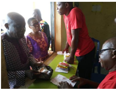
Beneficiaries receiving free medication at the pharmacy unit during the outreach