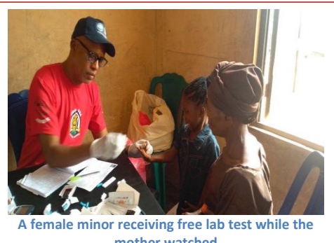
A female minor receiving free lab test while the mother watched