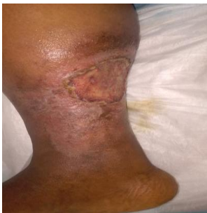
Leg ulcer before treatment