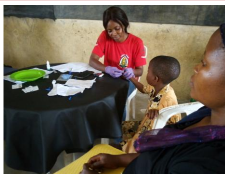
A female minor receiving free lab test while the mother watched