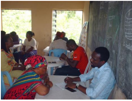
Doctors conducting health assessment and illness diagnosis on beneficiaries