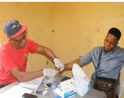
Beneficiaries receiving laboratory tests; HIV Testing Services (HTS), Test for Malaria Parasite, Test for Random Blood Sugar, during the Outreach at Offi-Uda