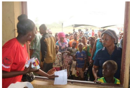
Beneficiaries receiving free medication at the Pharmacy unit during the outreach at Offi-Uda