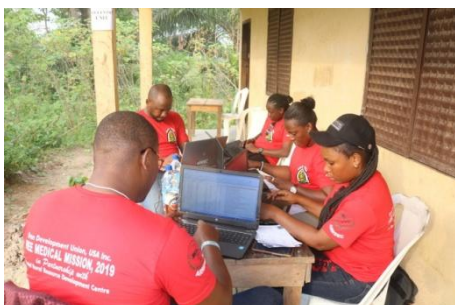
Data Entry unit, entering patients' records into the computer system during the outreach at Offi-Uda