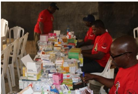
Pharmacists dispensing medications during the outreach at Offi-Uda