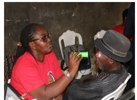
A male beneficiary receiving free eye care during the outreach at Offi-Uda