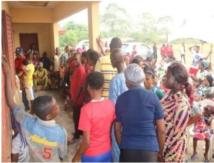
Community people of Offi-Uda waiting to be attended to