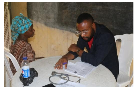
A female beneficiary being attended to by a doctor during the outreach at Offi-Uda