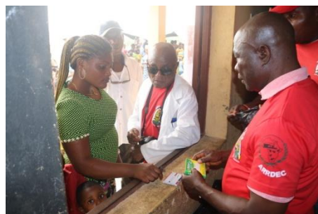
A beneficiary receiving free medication at the Pharmacy unit during the outreach at Offi-Uda