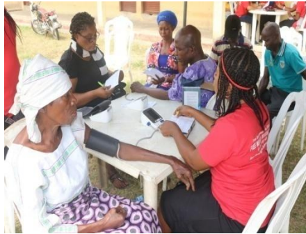
Nurses taking vital signs of beneficiaries during the outreach at Offi-Uda